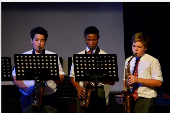
College's Jazz Band playing at Cordwalles