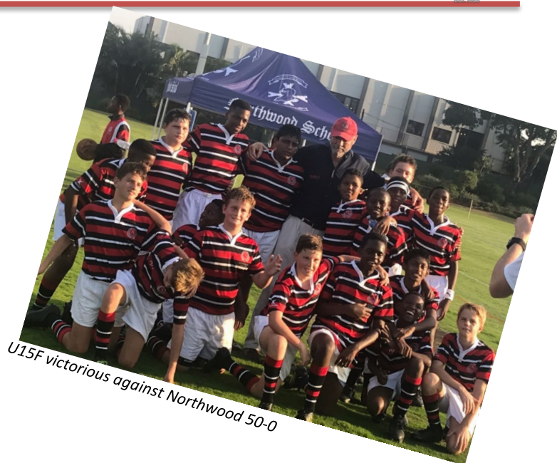
U15F victorious against Northwood 50-0

This week sees College travel away for the much anticipated round of fixtures against KES.