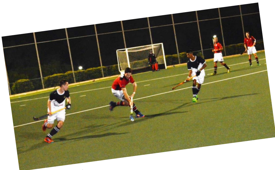
1 st XI vs. Northwood