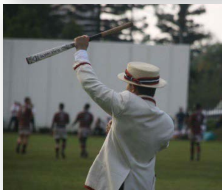
A shout out to our 1 st XV – we are behind you

Contact: Sally Upfold (Marketing Manager)