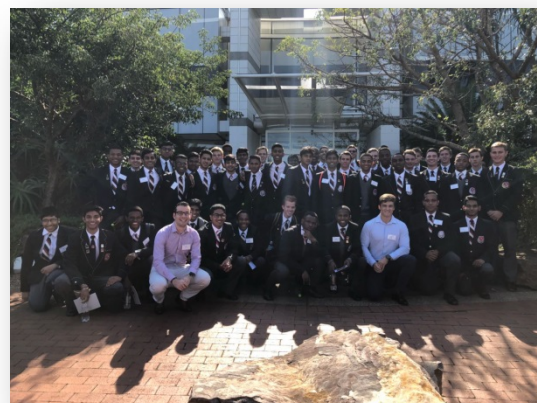
Form 6 Accountancy learners & staff

The autumn days are great for sunning in the garden with a good book. Thanks to the efforts of a couple of our library monitors, finding that elusive book has become a little bit easier: So if you fancy a warm orange book for the autumn evenings, then pop up to the Media Centre. They plan to refresh this display with other colours from the spectrum, so keep checking to find your perfect colour!