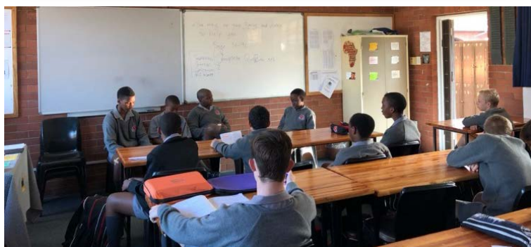
Form 2 boys sharing with their peers through group orals on prejudice

Contact: Sally Upfold (Marketing Manager)