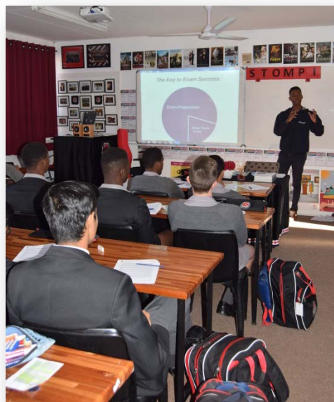
Our learners enjoyed the interactive and entertaining lessons that formed part of the next round Elevate teaching held on campus this week