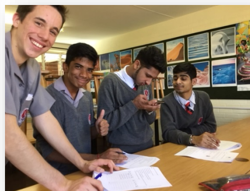
Matrics testing reaction time using an app on their smartphones as part of a practical exercise, looking at the nervous system

Stellenbosch University has recognised College for the quality of students we deliver. This year saw 12 college old boys graduate with undergraduate degrees and 6 with postgraduate qualifications across a range of areas of study in the sciences, commerce and humanities. This look set to continue with a further 12 OCs registering as students at Stellenbosch this year.