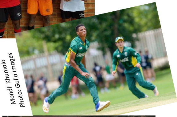
Mondli Khumalo