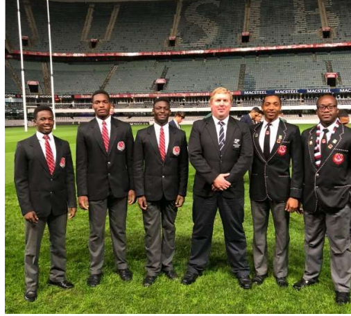
College Craven Week selections