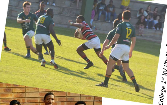
College 1st XV