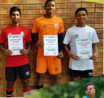
Soccer Team of the Tournament selections