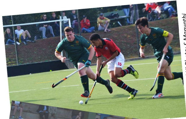
College 1st XI

Full details of our Sporting Results and Fixtures are available on D6 and on the school website www.maritzburgcollege.co.za/sport