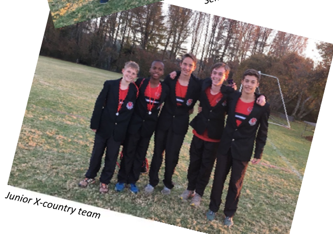
Junior X-country team