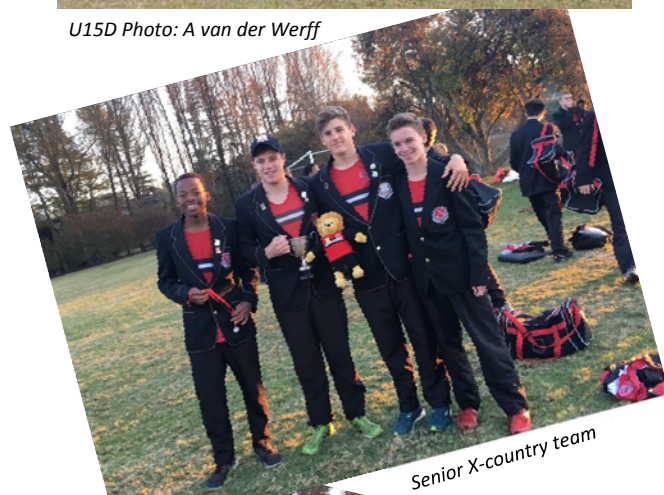
Senior X-country team