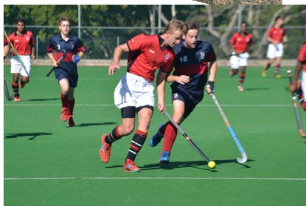
1 st XI

Full details of our Sporting Results and Fixtures are available on D6 and on the school website www.maritzburgcollege.co.za/sport