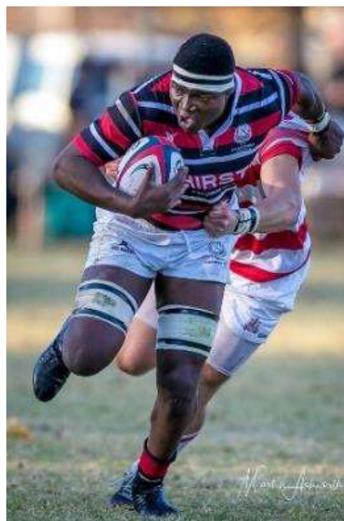
Above: Pure commitment: The head prefect on the charge vs Michaelhouse.