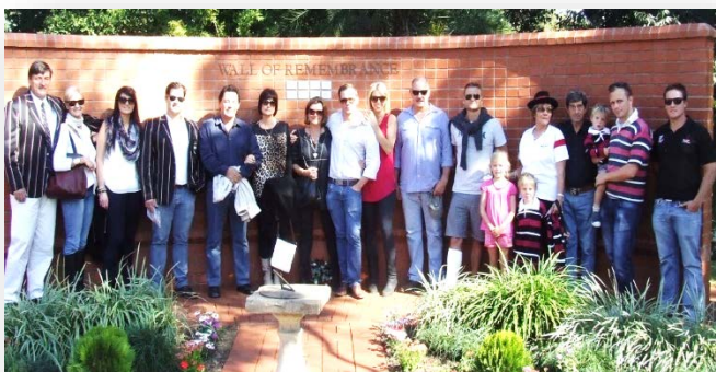
Family and friends of the men who made up the eight inaugural plaques, Reunion Day 2013

The deadline for the next order of plaques is 1 October 2018. They will be unveiled on Remembrance Day 2018, which will take place at College on Friday, 9 November – friends and family are of course encouraged to attend, and to say a few words. Thank you for supporting this most worthwhile and worthy initiative.