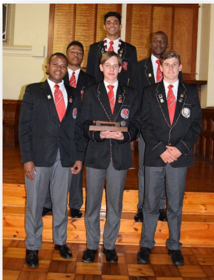
Outgoing 2018 office bearers with the newly elected office bearers for 2019