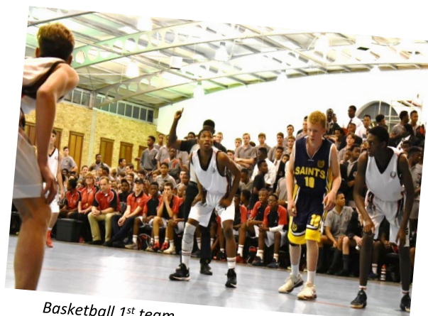
Basketball 1 st team