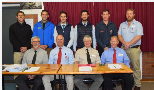
The Geography Team