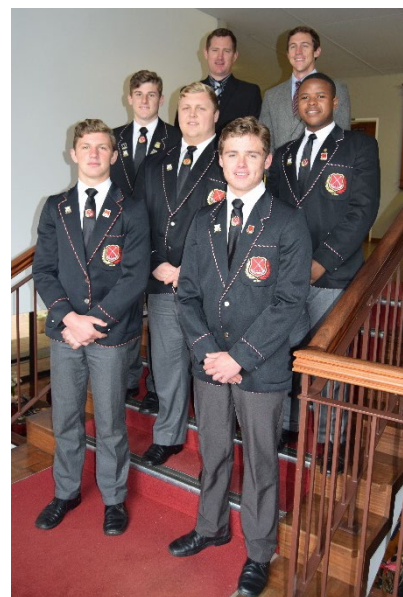
Senior Prefects 2019