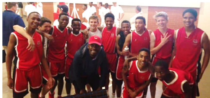
U16A/3rd basketball

A summary of results sowed College played 15, won 10 and lost 5.