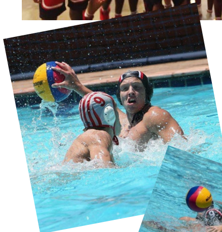
1 st team waterpolo

Our water polo teams took on Michaelhouse last weekend in number of fixtures winning 2 of their 7 matches, losing 3 and drawing 2. with good wins for the 2nd (7-2) and U15B (10-7) sides, and some very close losses and good draws.