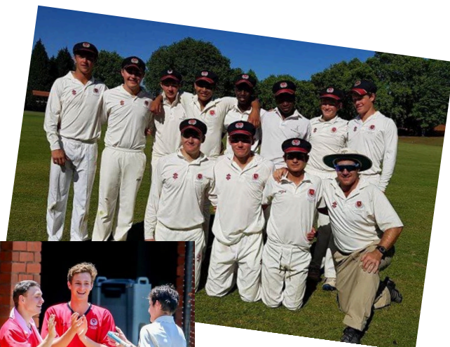
2 nd XI