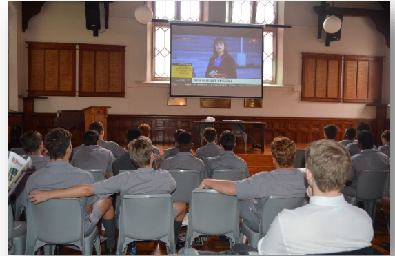
Watching the 2019 Budget presentation