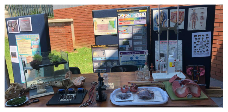
A recent display promoting Life Science, Physical Science and Agricultural Science at one of our open days.

Our hope is to create and foster an appreciation for and fascination in Life Sciences. My thanks go to the professional and dedicated staff-members that make up the Life Sciences department as well as the hard working young men that take on this demanding subject.