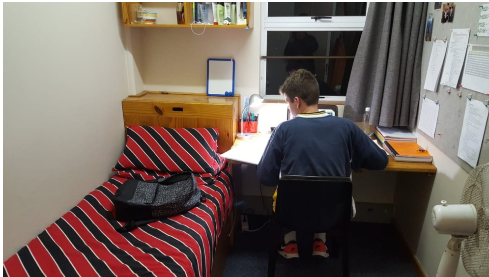
LEFT: Our boys burning the midnight oil.