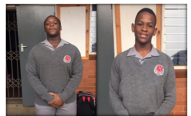
A Matsheke (6<sup>th</sup> Form) A Ndwandwe (3<sup>rd</sup> Form) 2<sup>nd</sup> in shotput at the Top 40 Squash U16A KZN Champs