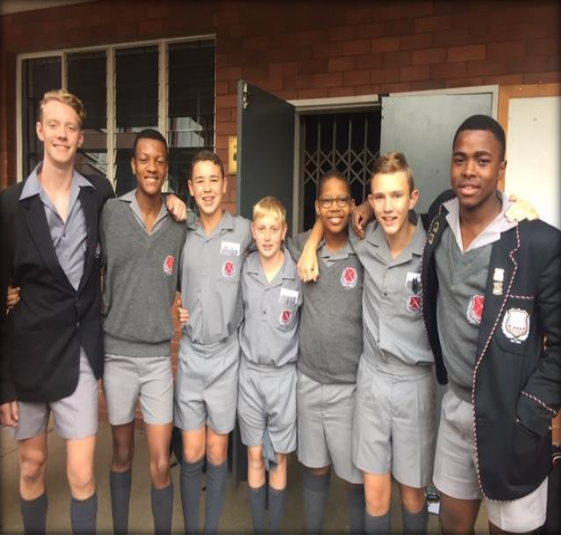
PAPE HOUSE BAND