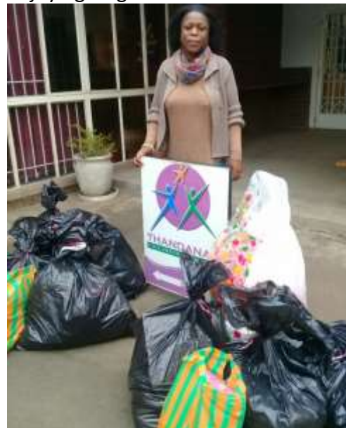
Some of the items dropped off at Thandanani, unfortunately we where unable to visit the home.