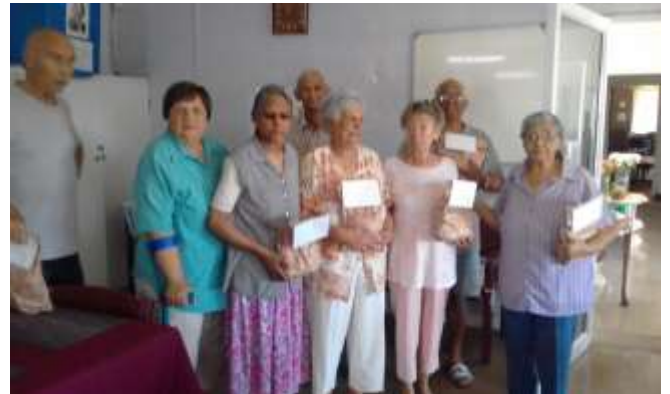
A few of the Ladies and Gentleman after receiving their gifts.

The Boys in there mentor groups took the time to write a short note the the Ladies and Gentleen of Isabel Beard, some of these messages have been included on the following page.