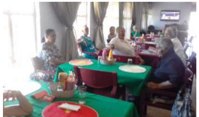
Enjoying a light snack