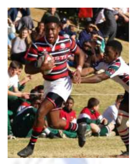
Beast Mode activated by Masvikeni