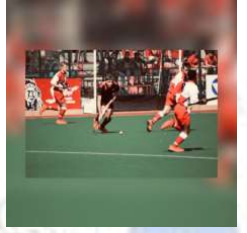
WHEN THINGS GET STICKY