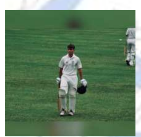
If we had to mention gems in the house off the BAT... we wouldn't forget Goedeke