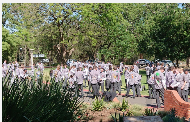
Above: The shirt-signing on the Forder Oval, an hour before Speech Day.