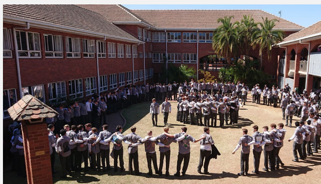
The Victoria Cross lives on

And speaking of “done very well”, I think I simply must spend a few moments dwelling on the Victoria Cross or