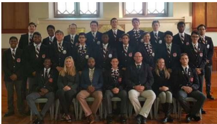
2019 Calder House Matrics

To the House Leaders and Matrics of 2019, thank you for your efforts and commitment to the house and the part you have played in growing the status of Calder House this year. We believe that the House Leaders for 2020 will place their own unique stamp on the house and continue the efforts of those before them. This will be an opportunity to fulfil leadership roles within the house, support those in the younger grades and make the new form 2s feel welcome. I wish them every success next year. We wish our Matrics the best of luck for their final examinations.