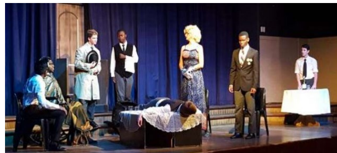
The House Play: (Best house performance event for Commons House – first position)

The House events which kept our young men challenged included the canoeing event which was unfortunately not the House strong point. The basketball event always draws a crowd and was well attended. This saw Commons House bounce back with vengeance coming fourth. After gaining momentum, the cycling boys added some fuel to the fire by bringing more promise to the field and to the scoreboard. Our waterpolo team was well attended and with a full complement of talented swimmers. Their stamina proved to be too much for most of the opposition. With a worthy fight and true grit, the team made their way into the semi-finals gaining some valuable points and they placed third.