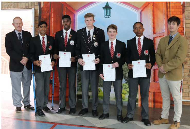
Commons House Leaders for 2020

"Gentlemen, on behalf of the 2019 leaders we'd like to congratulate each of you on your appointment as leaders for 2020. The future of Commons house is now in your hands, but I have no doubt that you guys will take the House to even greater heights. I encourage all of you to really get stuck in and give it your all, you won't regret it. Last but not least, enjoy every moment, it goes by in the blink of an eye. Good luck."