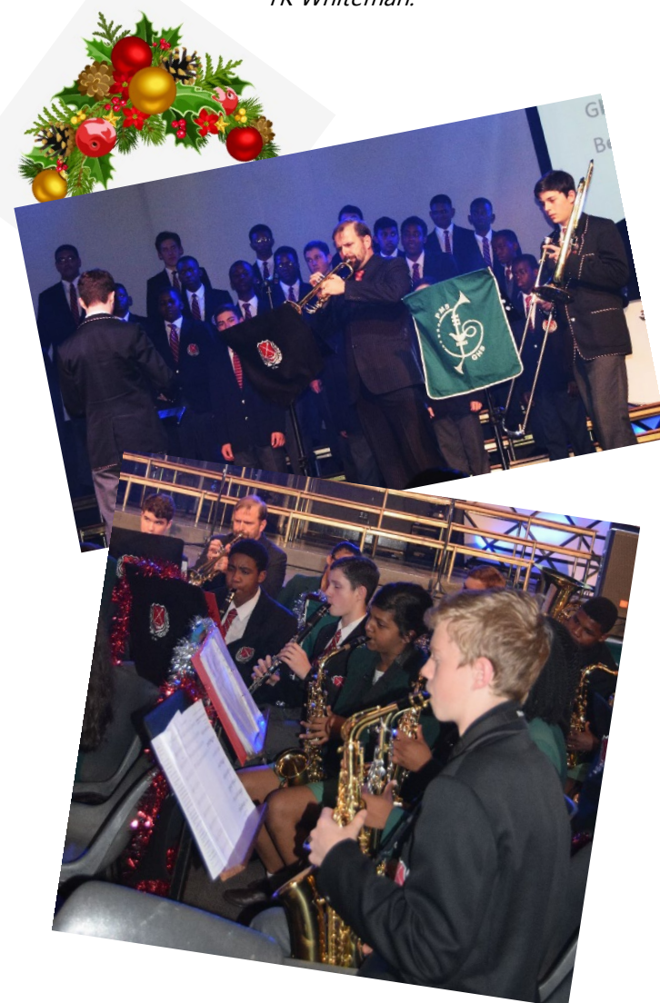
College boys and staff performing at the 4 th Annual Capital Christmas Concert