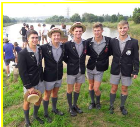
Some of the Nathan House prefects supporting the Duzi.