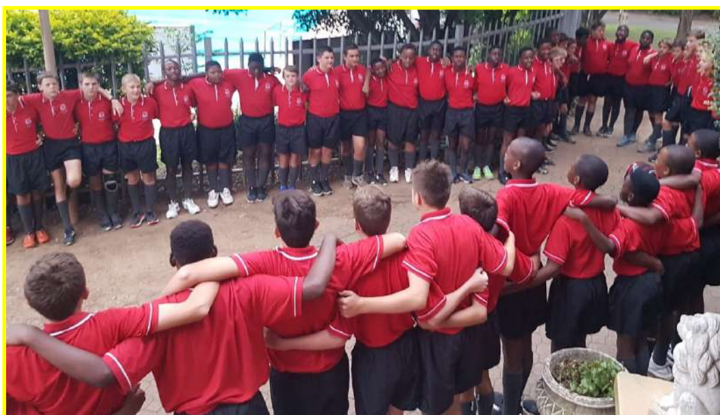
The boys getting ready to sing Oh Boys of Nathan's for the first time.