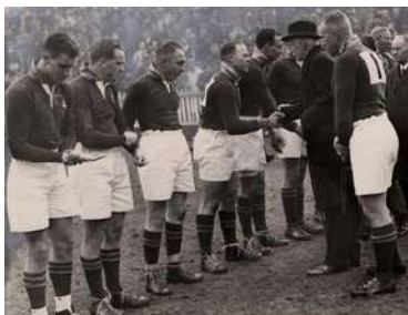
The captain of the 1937 Springboks to New Zealand, Philip Nel (OC 1921) (far right), introduces a local dignitary to his team, during his team’s triumphant tour of Australasia. The future rugby boss, Dr Danie Craven, appears second from the left.

A stand-out player in the early years was strapping farm boy, Philip Nel, who was the First XV captain and all-powerful head prefect of the school in 1921. Nel captained the Springbok team on its all-conquering tour of Australia and New Zealand in 1937. It remains the only Springbok team in history to have defeated the All Blacks in New Zealand. Such was the quality of the play of his imperious team that it was given the tongue-in-cheek accolade of being “the greatest team to leave New Zealand’s shores”. On the ship returning home, Nel formally announced his retirement from Springbok rugby by throwing his trusty old rugger boots into the sea. Like Alexander the Great, he had no more worlds to conquer.