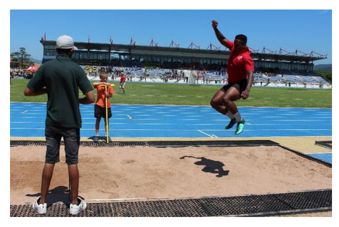
Proof, that anything is possible with Nicholson's 'Gees'