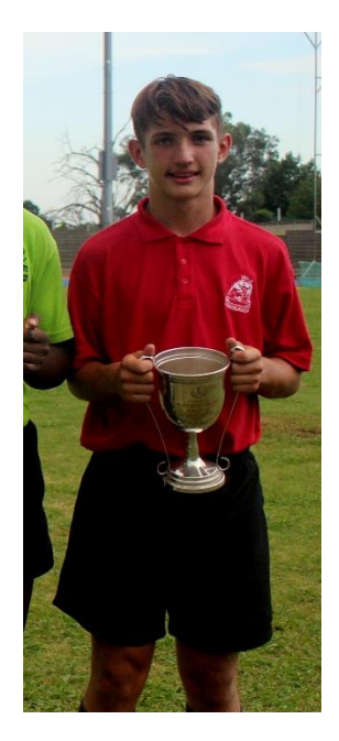
INTER-HOUSE BASKETBALL Seniors 1<sup>st</sup> place Juniors 2<sup>nd</sup> place