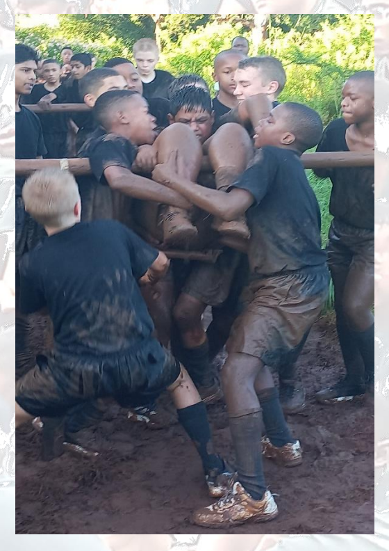
Form 2 work together to overcome obstacles

The start of this year has been one of growth and development for Snow House. Even before the seniors returned for the year, the Borvers and their peers embarked on their "Rite of Passage" camp. It was a resounding success. Hosted in the bush at Tala and led by the prefects under the guidance and supervision of staff from "Spirit of Adventure" the new boys took on 24 hours of activities over two days.