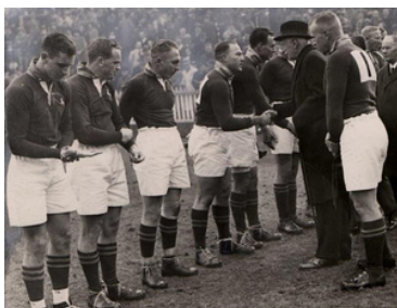
The captain of the 1937 Springboks to New Zealand, Philip Nel (OC 1921) (far right), introduces a local dignitary to his team, during his team’s triumphant tour of Australasia. The future rugby boss, Dr Danie Craven, appears second from the left.

A stand-out player in the early years was strapping farm boy, Philip Nel, who was the First XV captain and all-powerful head prefect of the school in 1921. Nel captained the Springbok team on its all-conquering tour of Australia and New Zealand in 1937. It remains the only Springbok team in history to have defeated the All Blacks in New Zealand. Such was the quality of the play of his imperious team that it was given the tongue-in-cheek accolade of being “the greatest team to leave New Zealand’s shores”. On the ship returning home, Nel formally announced his retirement from Springbok rugby by throwing his trusty old rugger boots into the sea. Like Alexander the Great, he had no more worlds to conquer.