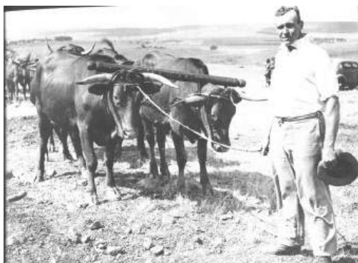
Retired Springbok captain, Philip Nel, on his farm in the Kranskop district.